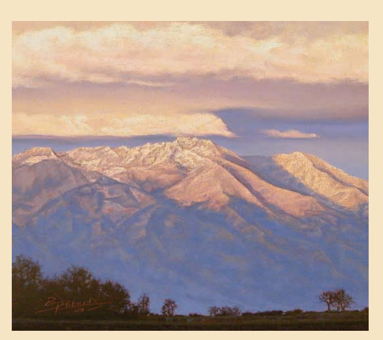
Dusting on the Sangres, 14" x 16", Oil

web: www.barbarafracchia.com • 510-525-7057 email: mfracchia@comcast.net