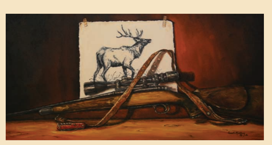
September Song, 12" x 24", Oil on Canvas

web: www.bettynancesmith.com • 505-662-4076