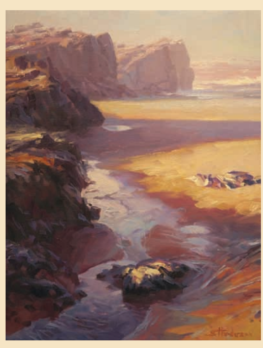
Exposé, 14" x 18", Oil on Canvas

web: www.cuaa-art.com • 832-654-8752 email: aeromotiveartist@vahoo.com