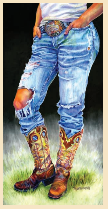
Country Girl, 48" x 24", $2,900