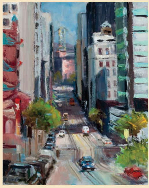
California Street, 20" x 16", Oil on Linen

web: www.stevehendersonfineart.com • 509-382-9775