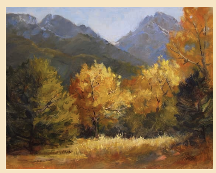
Autumn in Crestone, 11" x 14", Oil

web: www.gaiastudiosandgallery.com • 208-473-2335 email: kelbeach@me.com