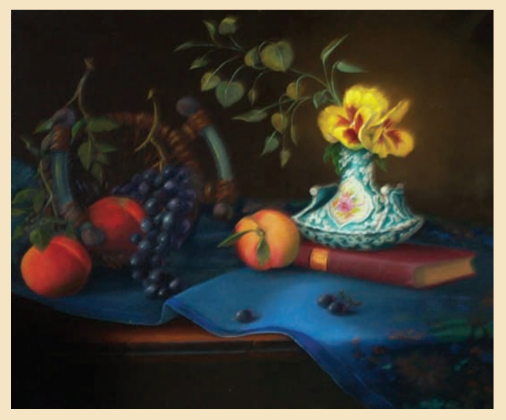
Pansies in a Handpainted Vase, 20" x 24", Oil on Canvas