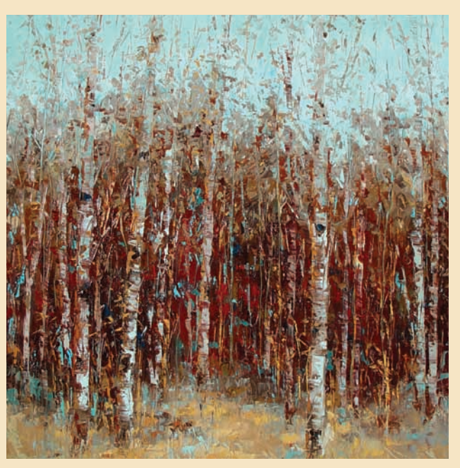
Splendor #2, 30" x 30", Oil

web: www.wnightingale.com • 575-758-3255 web: www.peggyimmel.com