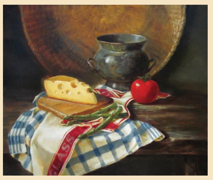
Favorite Cheese, 24" x 30", Oil

web: www.colorofthewest.com • 817-994-7663 email: sharon.markwardt@gmail.com