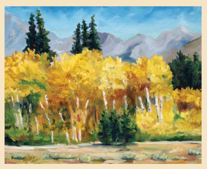
Fall at Snow Creek, Oil

web: lindanearonstudio.com email: lindanearon@msn.com